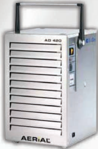
AD 420-VA (stainless steel casing)