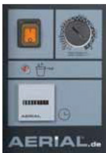
Simple to operate

Pump-out kits are now available for the latest AD 5 and AD 6 units. Depending on the application these can be added and removed without tools, meaning the dryers are now even more flexible.