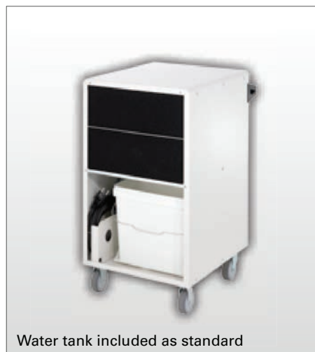
Water tank included as standard