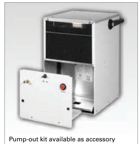
Pump-out kit available as accessory

► These units can be fitted with AERIAL pump-out kits at any time. In just a few steps the pump-out kit is installed – and it can be removed just as quickly, too.