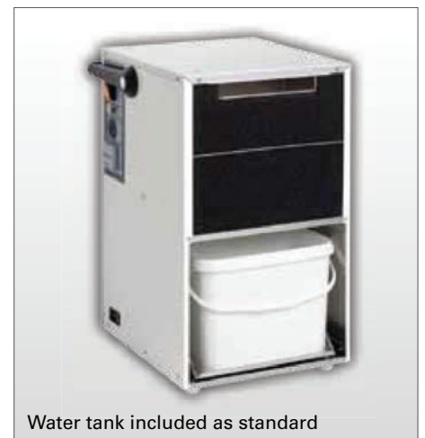
Water tank included as standard