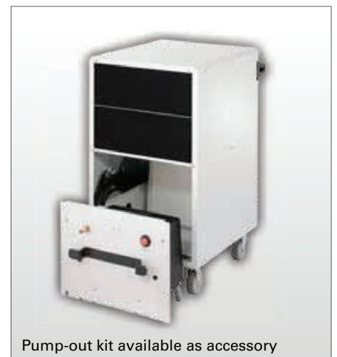
Pump-out kit available as accessory