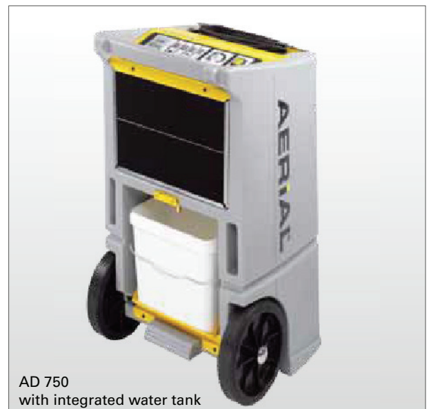
AD 750 with integrated water tank