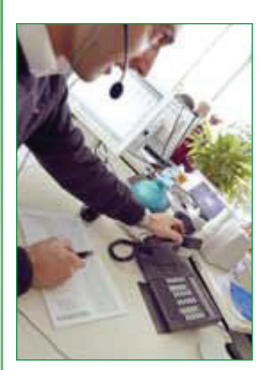
Please contact us.

HygroMatik high-pressure systems are the hygienic, energy efficient solution for high humidification outputs for office buildings, hospitals, production halls, laboratories and many other applications.