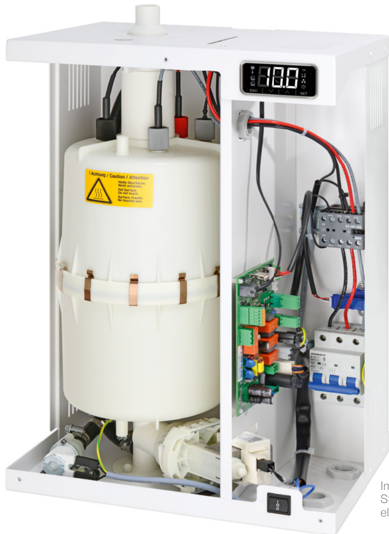
Image: StandardLine electrode